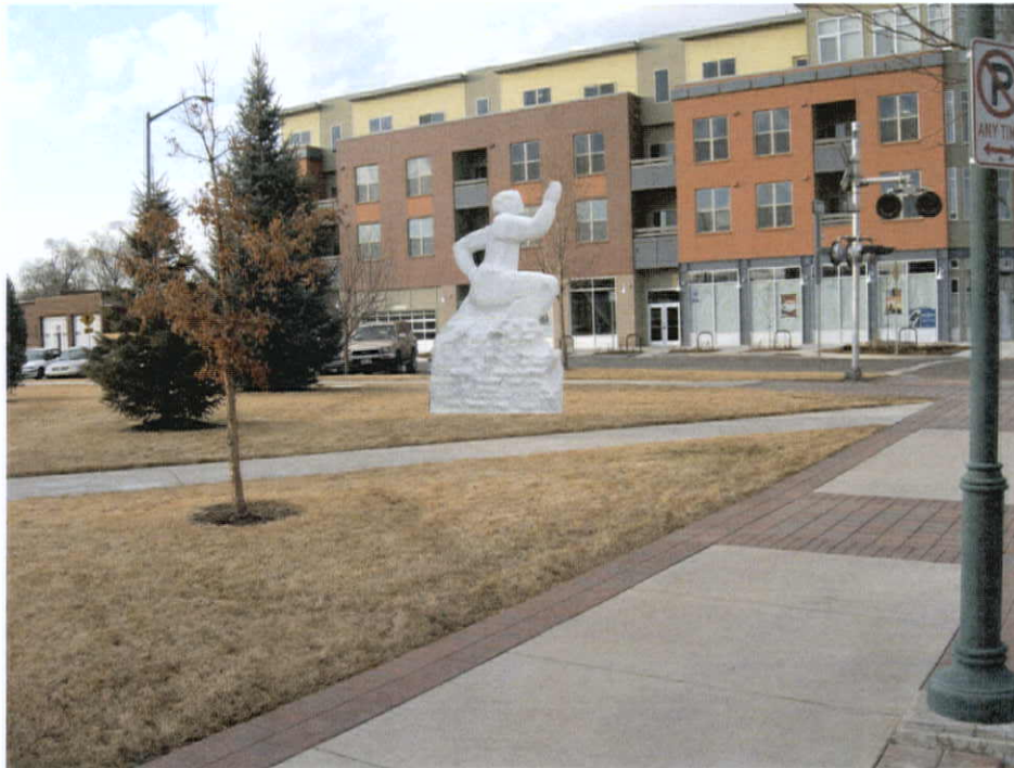
Southwest corner of North Mason and Maple Streets across the street from Penny Flats