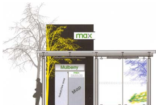
Mason Transportation Corridor