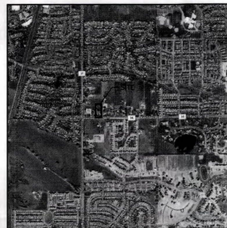
VICINITY MAP SCALE: 1" = 2000'