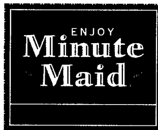
Fruit Juices & Drinks