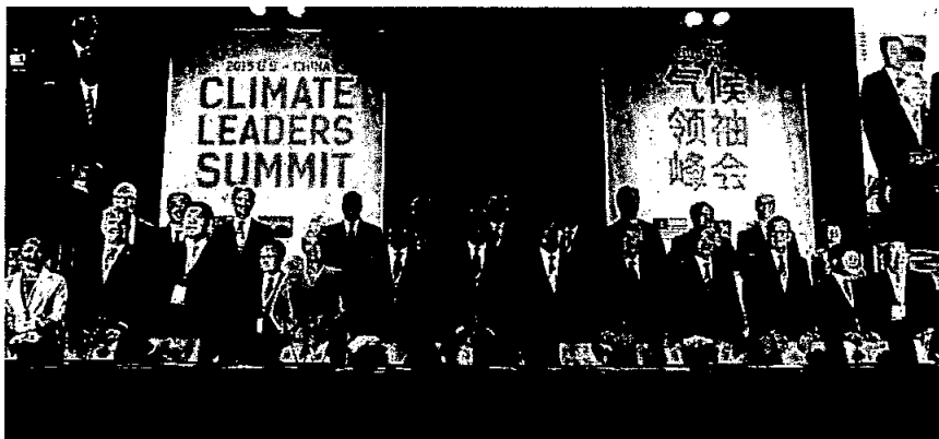
U.S. Climate Mayors meeting with their counterparts from China at the U.S. China Climate Summit in Los Angeles

We lead 39 small and large American cities, comprising nearly 31 million Americans in both blue and red states. We have joined together in the U.S. Mayors' National Climate Action Agenda (MNCAA), or the #ClimateMayors, in addressing the greatest challenge of our time, climate change. Each of our cities is committing to ambitious targets to reduce greenhouse gas emissions, set climate action, regularly report on our progress, share lessons and hold each other accountable. Around the globe, cities are working together through organizations like C40 as well.