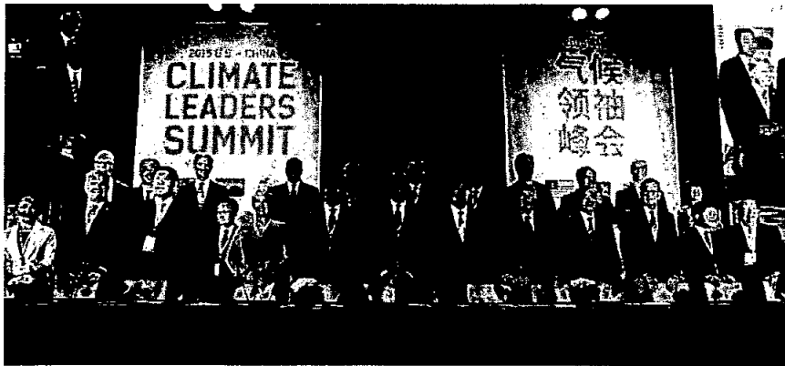
U.S. Climate Mayors meeting with their counterparts from China at the U.S. China Climate Summit in Los Angeles

We lead 39 small and large American cities, comprising nearly 31 million Americans in both blue and red states. We have joined together in the U.S. Mayors' National Climate Action Agenda (MNCAA), or the #ClimateMayors, in addressing the greatest challenge of our time, climate change. Each of our cities is committing to ambitious targets to reduce greenhouse gas emissions, set climate action, regularly report on our progress, share lessons and hold each other accountable. Around the globe, cities are working together through organizations like C40 as well.