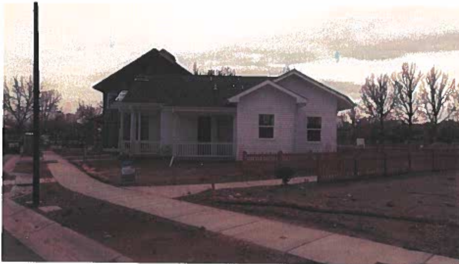
SIDE VIEW-Photo Date: 4/7/2017