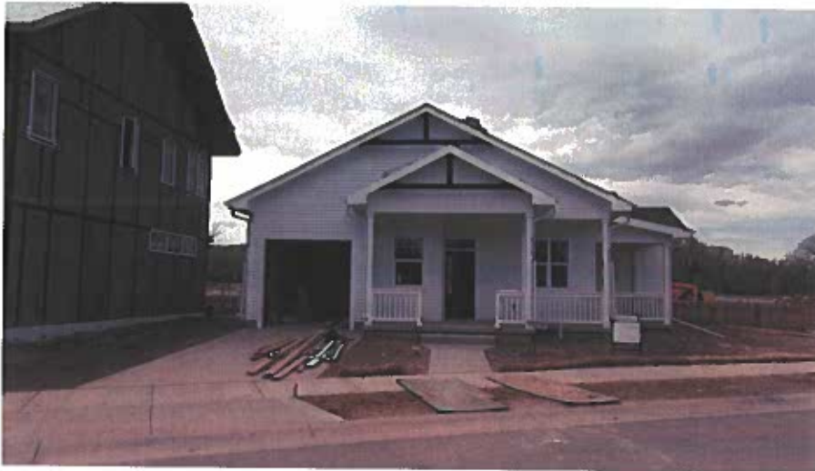
FRONT VIEW-Photo Date: 4/7/2017

If using the Elevation Certificate to obtain NFIP flood insurance, affix at least 2 building photographs below according to the instructions for Item A6. Identify all photographs with date taken; "Front View" and "Rear View"; and, if required, "Right Side View" and "Left Side View." When applicable, photographs must show the foundation with representative examples of the flood openings or vents, as indicated in Section A8. If submitting more photographs than will fit on this page, use the Continuation Page.