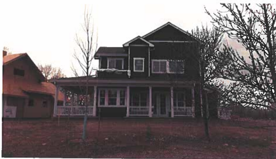
REAR VIEW-Photo Date: 4/7/2017