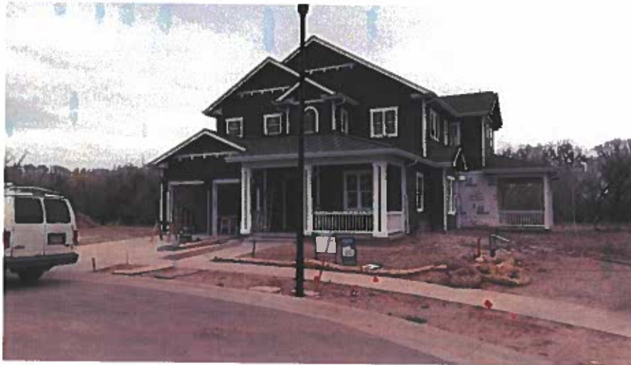
FRONT VIEW-Photo Date: 4/7/2017

If using the Elevation Certificate to obtain NFIP flood insurance, affix at least 2 building photographs below according to the instructions for Item A6. Identify all photographs with date taken; "Front View" and "Rear View"; and, if required, "Right Side View" and "Left Side View." When applicable, photographs must show the foundation with representative examples of the flood openings or vents, as indicated in Section A8. If submitting more photographs than will fit on this page, use the Continuation Page.