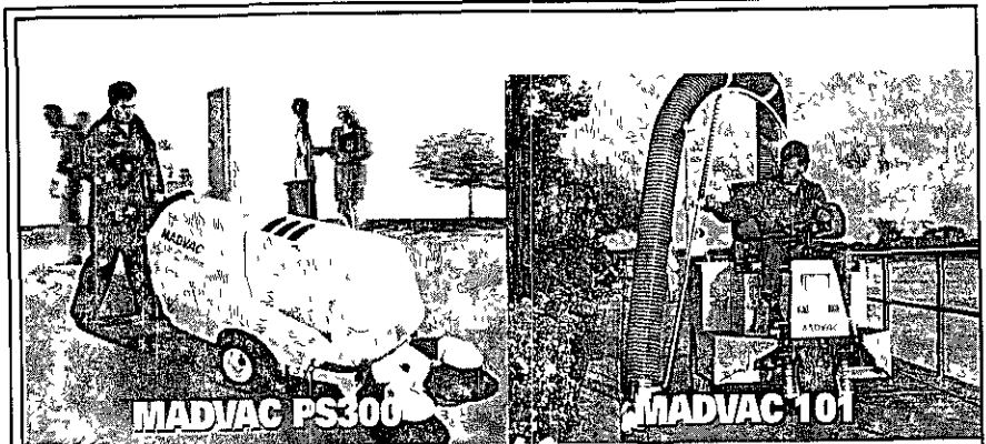
MADVAC PS300 MADVAC PS300 walk behind sweeper cleans litter from heavily congested pedestrian filled downtown areas quietly & efficiently